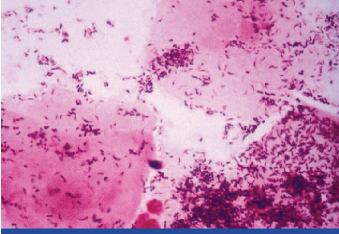
[Table/Fig-7]: Showing Gram variable rods suggestive of Gardnerella vaginalis